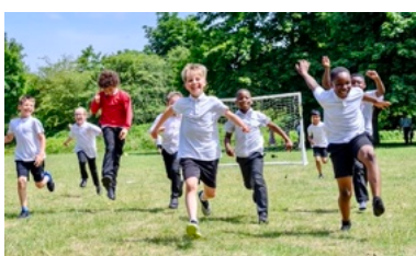
Work, Rest & Play