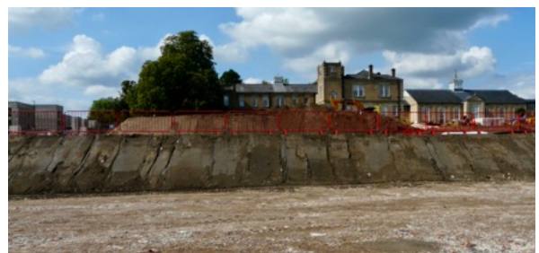
Ground works at the Ellison Institute site: they are creating a basement auditorium

Padua Way (a twin town of Oxford) was not our choice and neither was Lavender Drive!