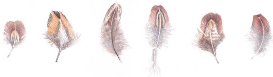
Pheasant feathers from the Thames Path: coloured pencil drawing: Editor

For other opportunities to volunteer locally, see p 2. Ed