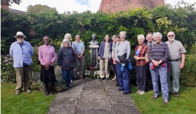
LLHS members and our host beside the new bust of John Henry Newman in the courtyard garden at Newman College

On Saturday 19 August , LLHS members, friends and families were welcomed by the Sisters at Newman College Littlemore to see and hear, in this beautiful building with its delightful courtyard garden, the remarkable history of John Henry Newman's work in Littlemore. The fine bust of JHN on a pedestal is a recent addition to the garden.