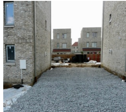
Waiting for trees: new homes at Newman Place

She has photographed the new road sign and sent it to family members, including some in Ireland. Her uncle was Cardinal Cahal Daly (1917 - 2009), former Roman Catholic Primate of All Ireland. He was a regular visitor to Littlemore and when here, he would call into Newman College causing much excitement.